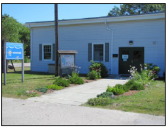
NBNERR Lab & Learning Center

The Narragansett Bay Research Reserve was dedicated in 1980 and is one of 29 protected estuaries in the National Estuarine Research Reserve System (NERRS), a partnership program between NOAA and the coastal states. The Reserve is located in the heart of Narragansett Bay on four islands: Prudence, Patience, Hope and Dyer and protects approximately 4500 acres of land and water; the headquarters are located on the south end of Prudence Island. The Reserve's mission is "to preserve, protect and restore coastal and estuarine ecosystems of Narragansett Bay through long-term research, education and training."