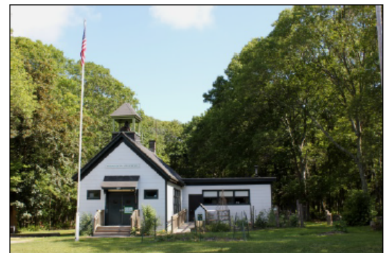
Prudence Island Schoolhouse

Contact the Prudence Conservancy ( www.prudenceconservancy.org ) to find out how you can support this work.