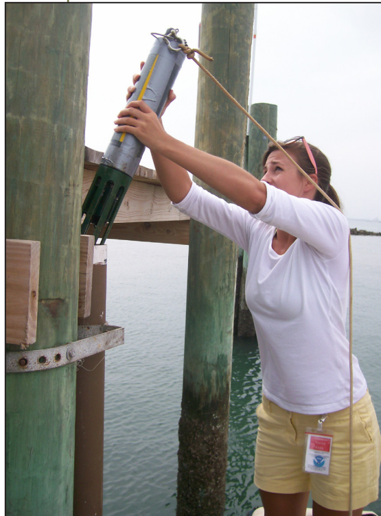
Placing a water quality and depth data sonde for the NERRS System-Wide Monitoring Program (SWMP) in North Carolina. SWMP data can be used to augment tidal wetland reference site data at NERR sites.

Additional deployments should capture water levels during seasonal transition periods.