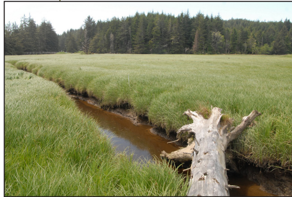
Figure 2. Carex Lyngbyei monoculture at 14 year old tidal wetland restoration site in Oregon.

Wetland surface elevation is a critical factor determining wetland plant community assemblages. In our study, vegetation plot elevations were a primary correlate of plant