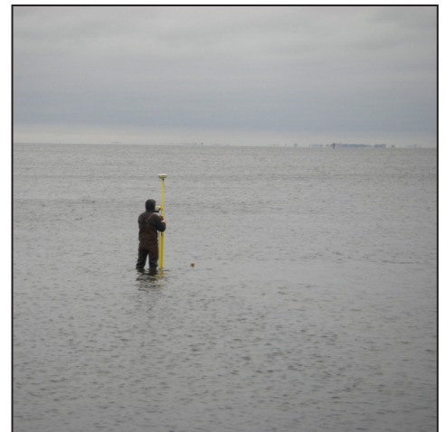
Collecting elevation data in North Carolina tidal flats using survey grade Real-Time Kinematic GPS instruments.