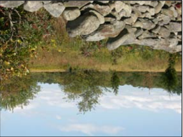
Pine Hill Trail