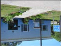
NBNER Lab & Learning Center

The Narragansett Bay Research Reserve was dedicated in 1980 and is one of 28 protected estuaries in the National Estuarine Research Reserve System (NERRS), a partnership program between NOAA and the coastal states. The Reserve is located in the heart of Narragansett Bay on four islands: Prudence, Patience, Hope and Dyer and protects approximately 4400 acres of land and water; the headquarters are located on the south end of Prudence Island. The Reserve's mission is "to preserve, protect and restore coastal and estuarine ecosystems of Narragansett Bay through long-term research, education and training."