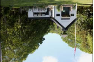
Prudence Island Schoolhouse

NBNER Lab & Learning Center - The NBNER lab headquarters are a great place to familiarize yourself with the island, including the keeper's ongoing research and stewardship projects. Our lab and learning center offers opportunities to learn about islanders and hands-on activities. During the summer months, the Estuary Education Shed (located at the base of the T-wharf) is open to visitors. Inside you will find a touch tank and several aquariums. Stocked with critters from the Bay, as well as fun activities for the kids. As you explore the island, you are likely to see signs of our restoration projects, which include the removal of invasive species (European larch, privet, ginkgo, autumn olive), controlled burning of pine barrens habitat and maintaining areas as coastal grasslands.